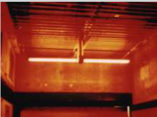
Glass Bending Oven With Quartz Furnace Heater®